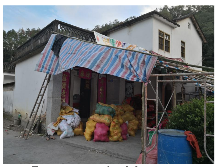
Temporary extension shelter