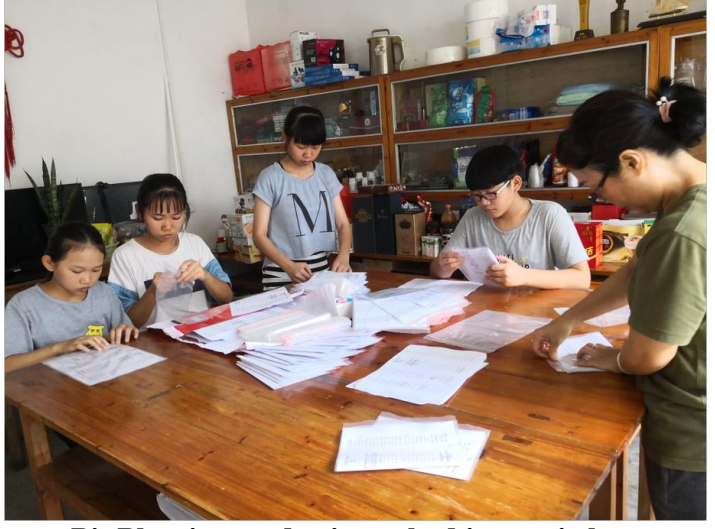
PinPhonics reader is packed in pastic bags