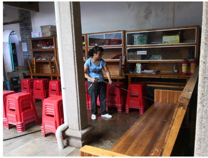
Power water spraying to clean up LSSC