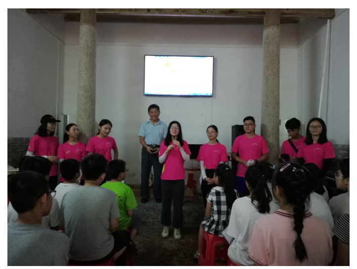
Speaking to our students