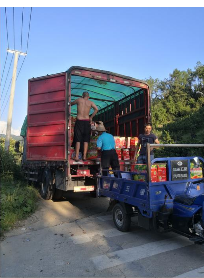
to transport truck on the main road.