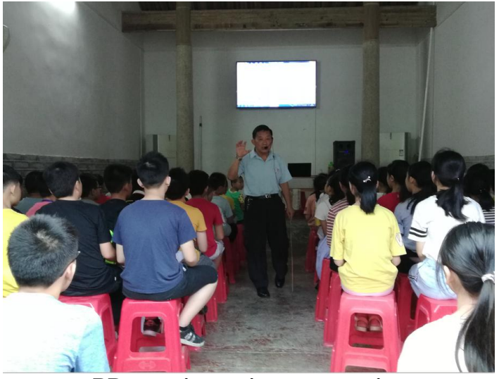
BD stressing an important point