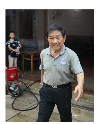
I can still do manual work