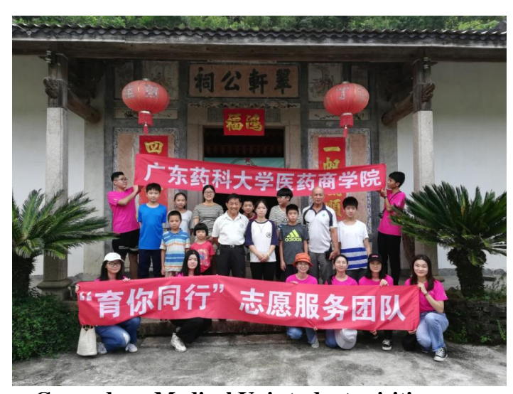
Guangdong Medical Uni students visiting