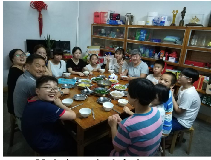
Meals time ...simple food