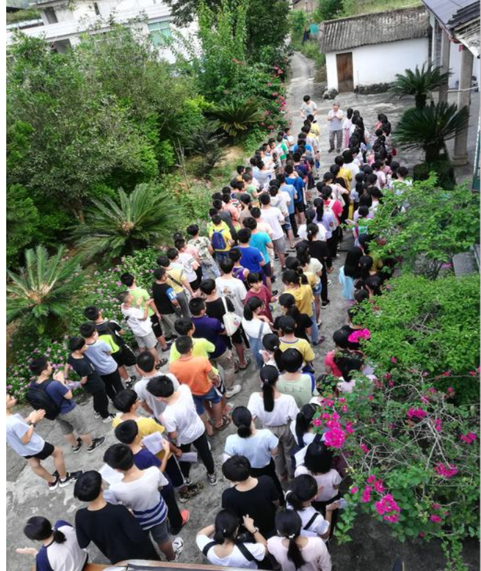
Parents watching the assembly