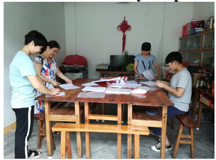
Getting materials ready for students