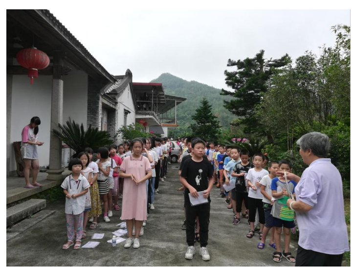
Junior students in front