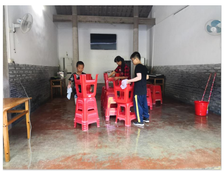
Washing, wiping and drying chairs