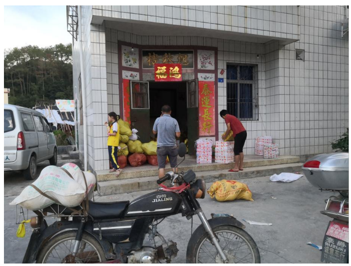
Another temporary house factory