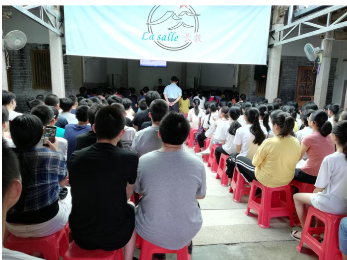
Assistant teaching - BD watching