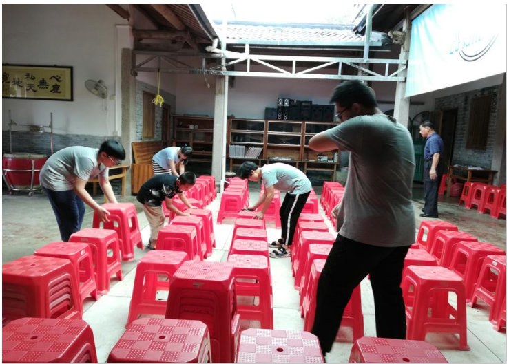
Arranging the chairs