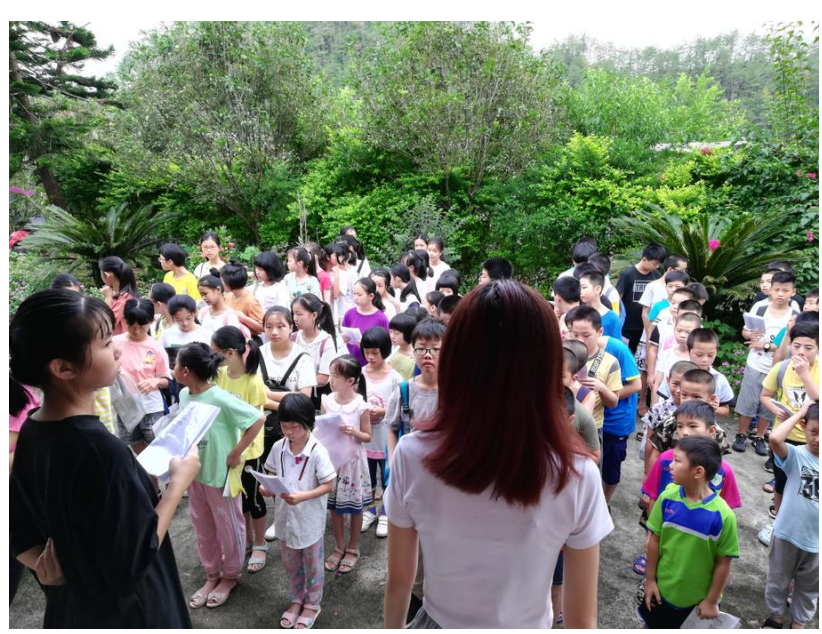
while lining up before lessons begin