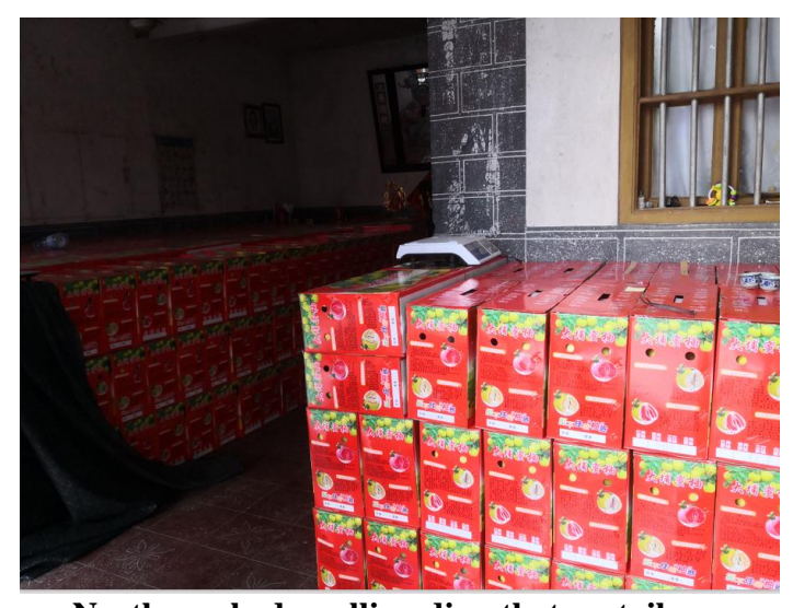
Neatly packed – selling directly to retailers