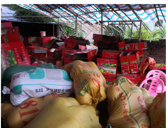
Improvised packing factory