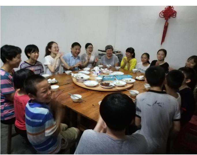
is fun time and learning session too.