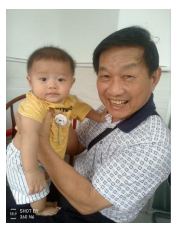
and take care of a baby!

As I mentioned in my 2^{nd} Quarter Report, I have to accept the fact that I no longer have the energy to run the usual Summer Programme where there were about 60 volunteers living in and we admitted 400+ students. We ran classes in the morning, individual and small group tuition in the afternoon and shows and activities at night.