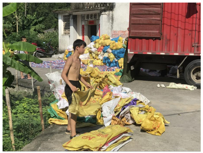
Selling pomelos to middleman