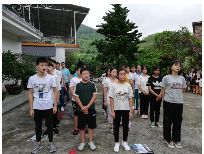
Senior students at the back