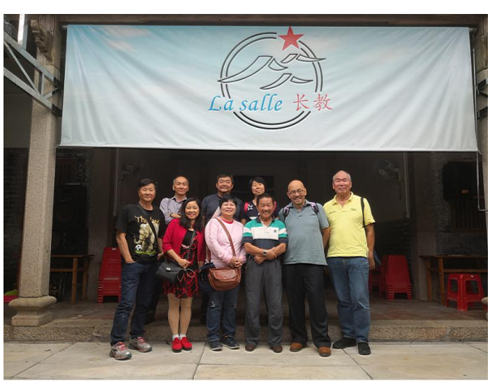
Recent Malaysia visitors