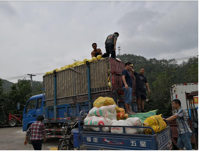
Loading up by thousand kilos