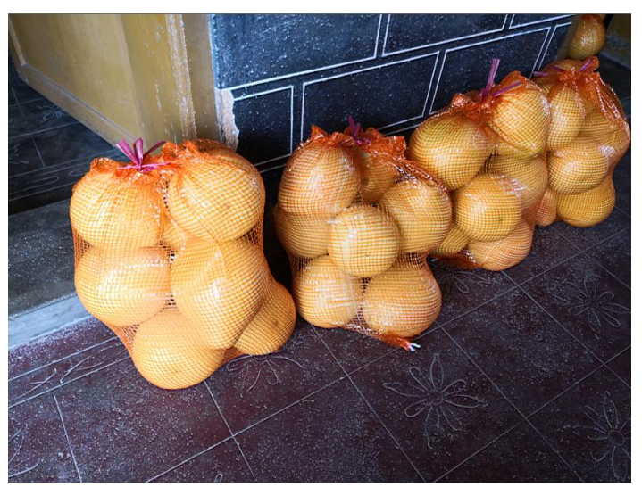
Doing our own bagging