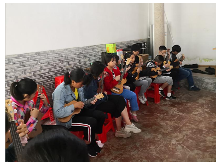
Some students learning to play the Ukulele

p.s. I forgot to download this year's photographs onto my USB. They are still in my computer at LSSC Changjiao. I will upload them onto <a href="www.lasallechina.com">www.lasallechina.com</a> when I get back to LSSC in the middle of January 2019.