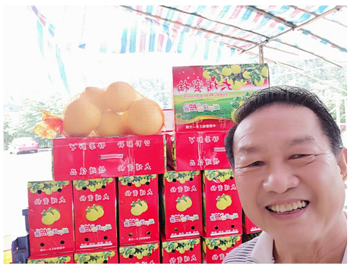
Any direct orders for 2019 ...