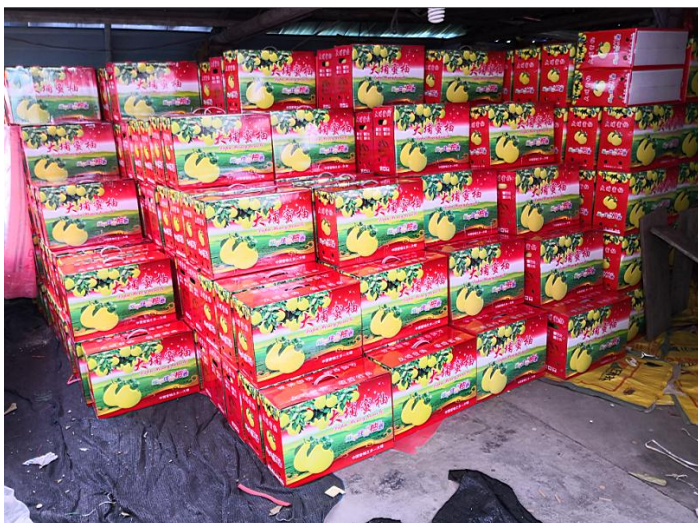
Packing into gift boxes