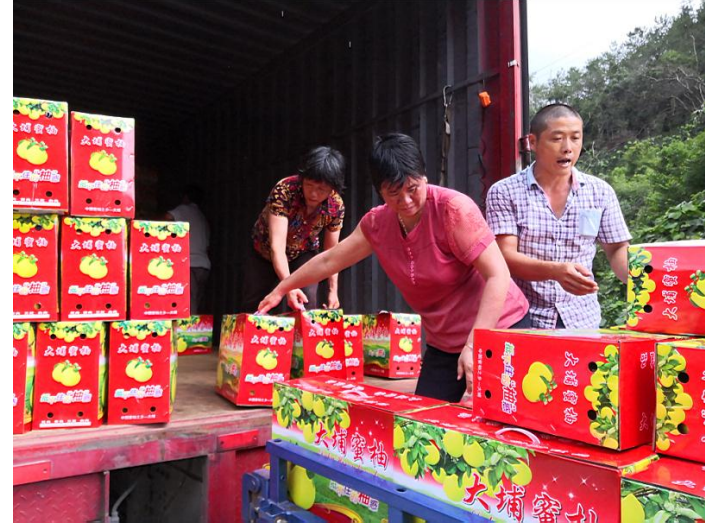
More work required