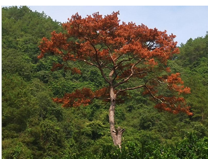
dying ... What a pity!

The immediate problem that I faced was that I had to rely on just a few junior high school students to assist me on registration day. I am very proud to say that they did a good job in handling parents – keeping them a good distant away from the assembly point - and directing the new students who came for registration. Interviewing and registering regular students was easy as they knew what was required and what to do on registration day. I was determined to keep the number of students to below 400. We started at 8 a.m. and by 11 a.m. while LSSC was still full of students waiting to attend the interviews before registration, I personally had to go out to put up a notice that admission was full. I had to continue the interview and the registration for another two hours. As usual, there were a few determined students who waited patiently till I came out and these serious students were also accepted.