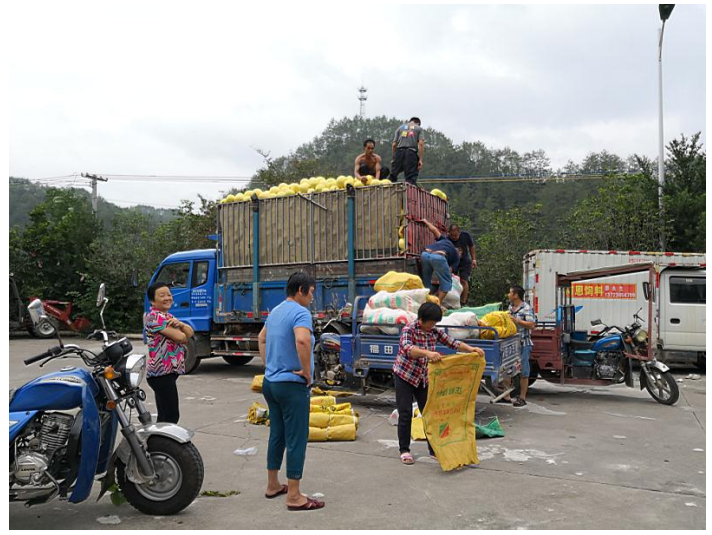
Selling to middle man