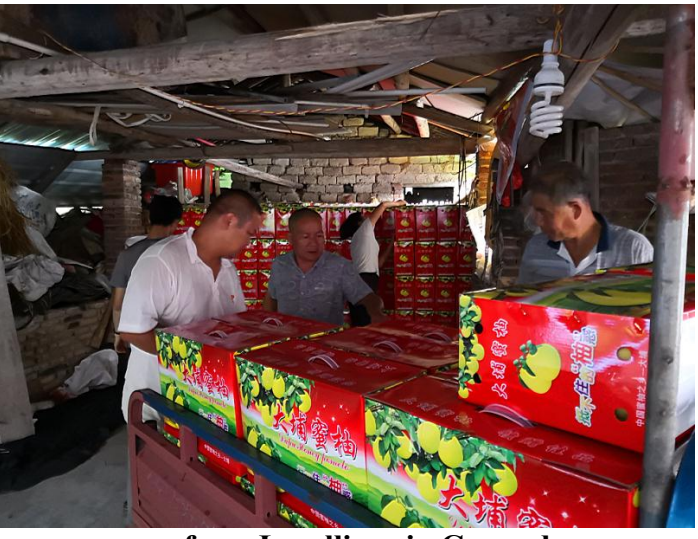
... from Lasallians in Guangdong