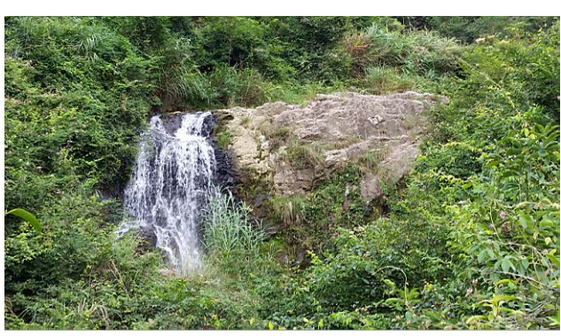
... clean and cool water.