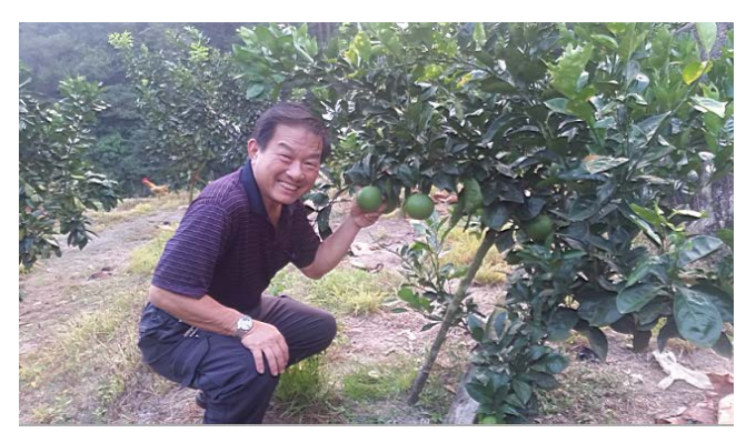
Oranges for CNY 2017