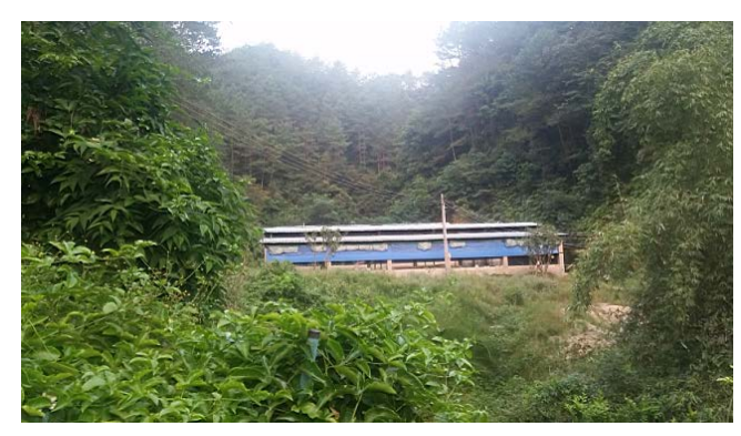
The pig farm in a cove.