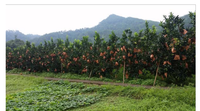
Pomelos neatly wraped

After our busy Summer Programme 2016, things quieten down and then schools reopened on 1<sup>st</sup> September and different universities started the 2016-17 academic year a week or two later. Weekend lessons at LSSC did not reopen in mid September as I had a busy schedule of meetings and a family reunion event. LSSC will resume it tuition activities with the Winter Programme on 16<sup>th</sup> January 2017. I plan to return to Hongkong on 8<sup>th</sup> Jan and will back at LSSC on 13<sup>th</sup> Jan 2017.