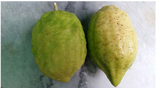
Local medical lemons.