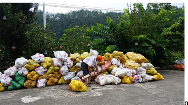
Carrying a bag at a time on the shoulder