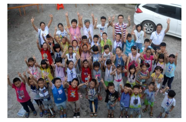
Class One looking up