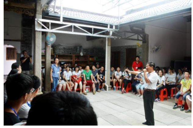
Public speaking session.