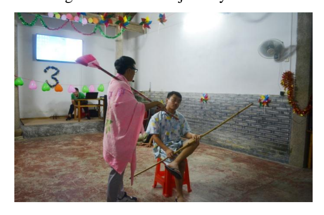
The Shark and Monkey