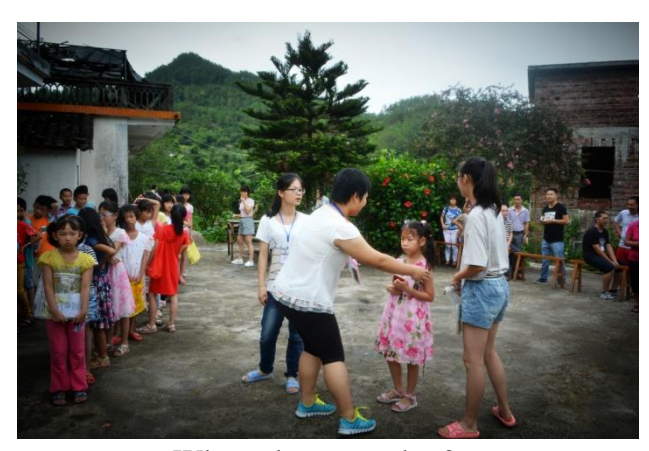
Where do we put her?