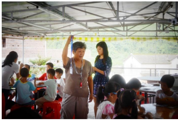
Wear your name tag!