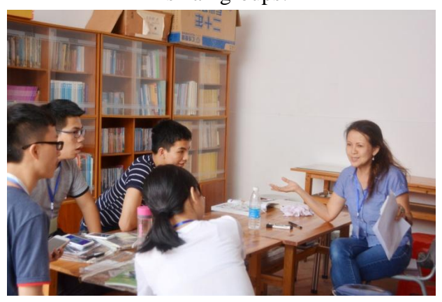
That's right. Just speak.