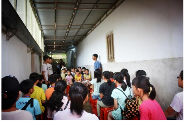
Junior teachers introducing themselves