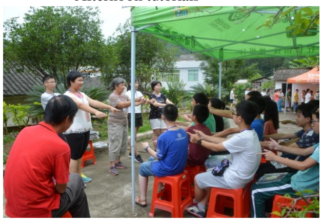
We sign and sing.