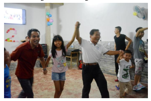
Who is having fun!