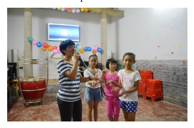
The winners are ...