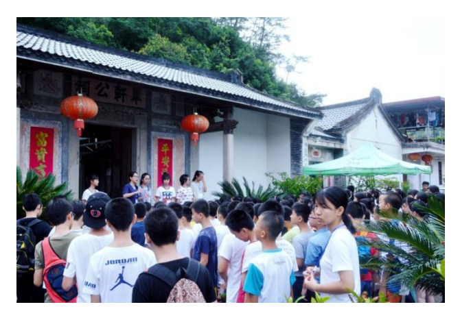
Assembly on the first day.