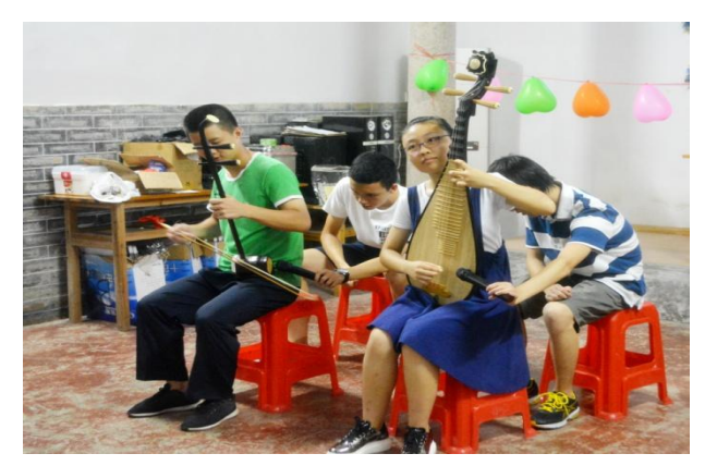
We have talents ...