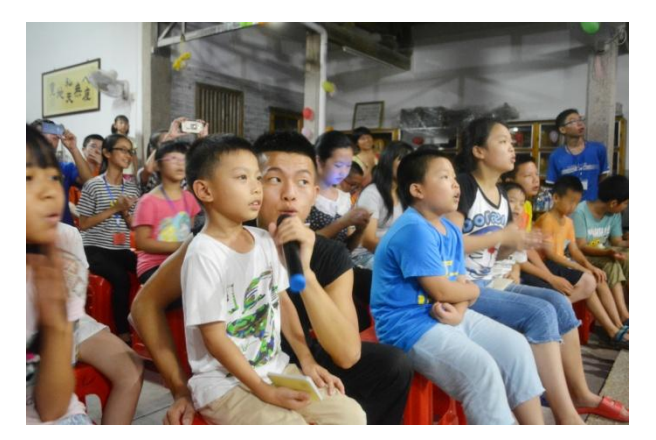
Come on sing ...