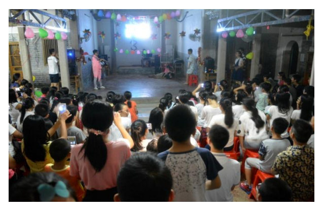
Evening activities – Our journey to the West