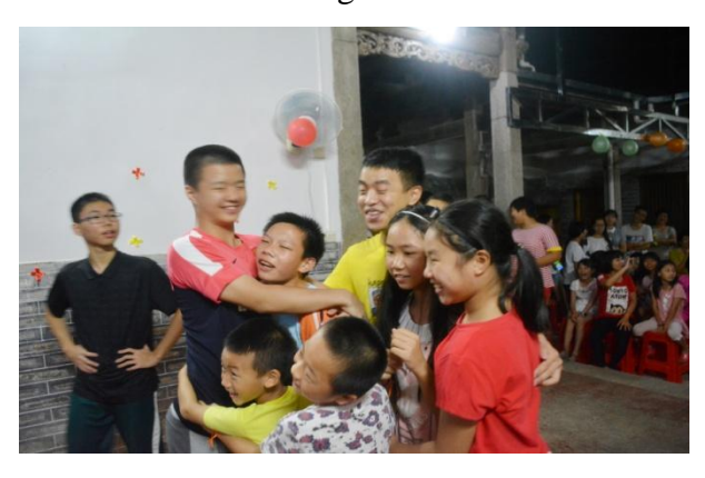
We hugged first!