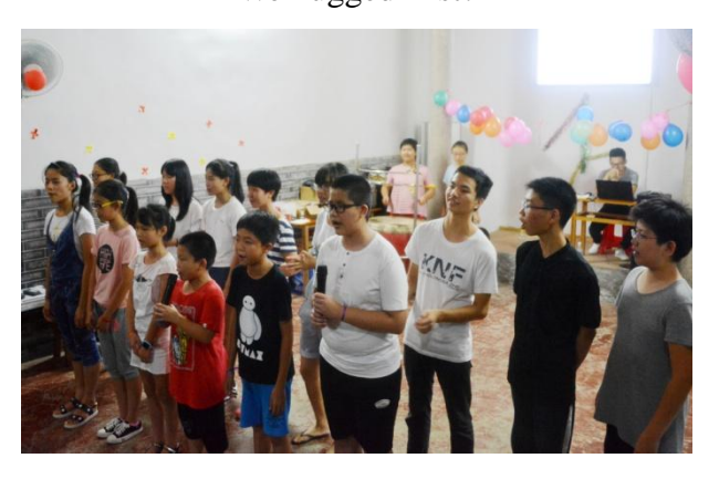
We sing for you,