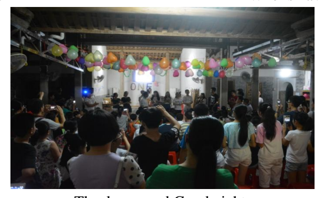
Thank you and Good night.