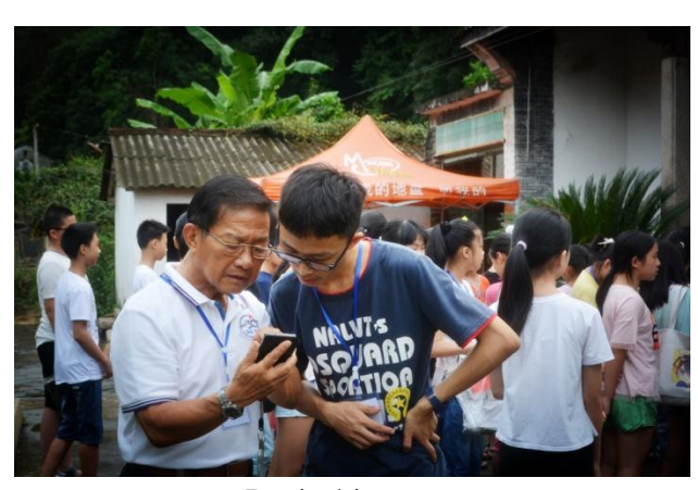
Do it this way.