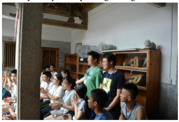
Wow ... not bad. They speak well.