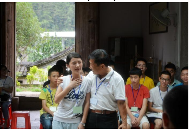
I cannot. I am scared.