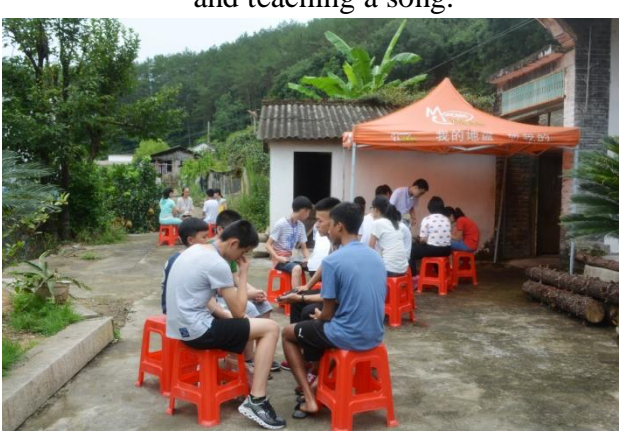
in small groups.