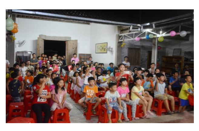
The captured audience.