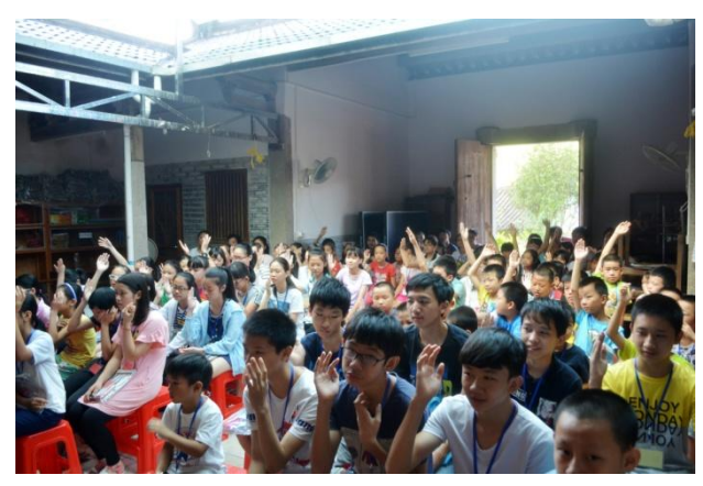
Their students actively responding.