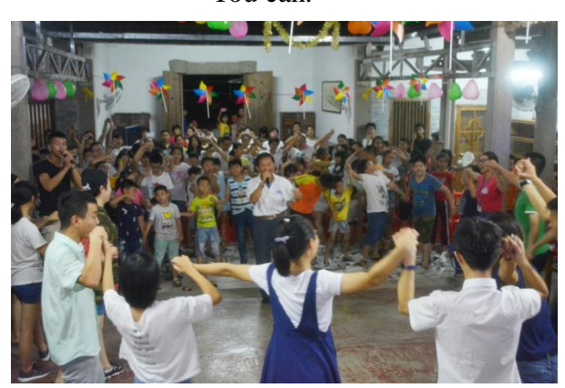
Together let's sing and dance.